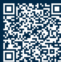
Online Registration Form